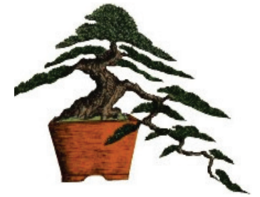
BONSAI SOCIETY OF AUSTRALIA